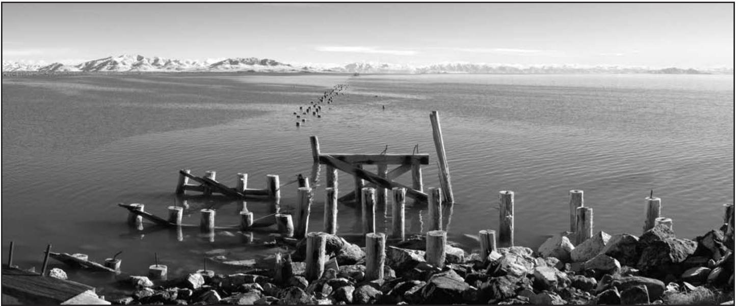
Lucin Cutoff Trestle Wood by Michael Slade

Its core principles will be stakeholder involvement and collaboration; data collection; resource assessment; clear problem prioritization; goal-setting; and effective implementation and evaluation. The new committee will carry on work begun by the Great Salt Lake Steering Committee, but in broader terms. It will not supplant the work of other formal and informal groups interested in GSL. Instead, the GSL Watershed Committee will coalesce financial and institutional resources to address GSL's challenges, with a focus on environmental and conservation issues.