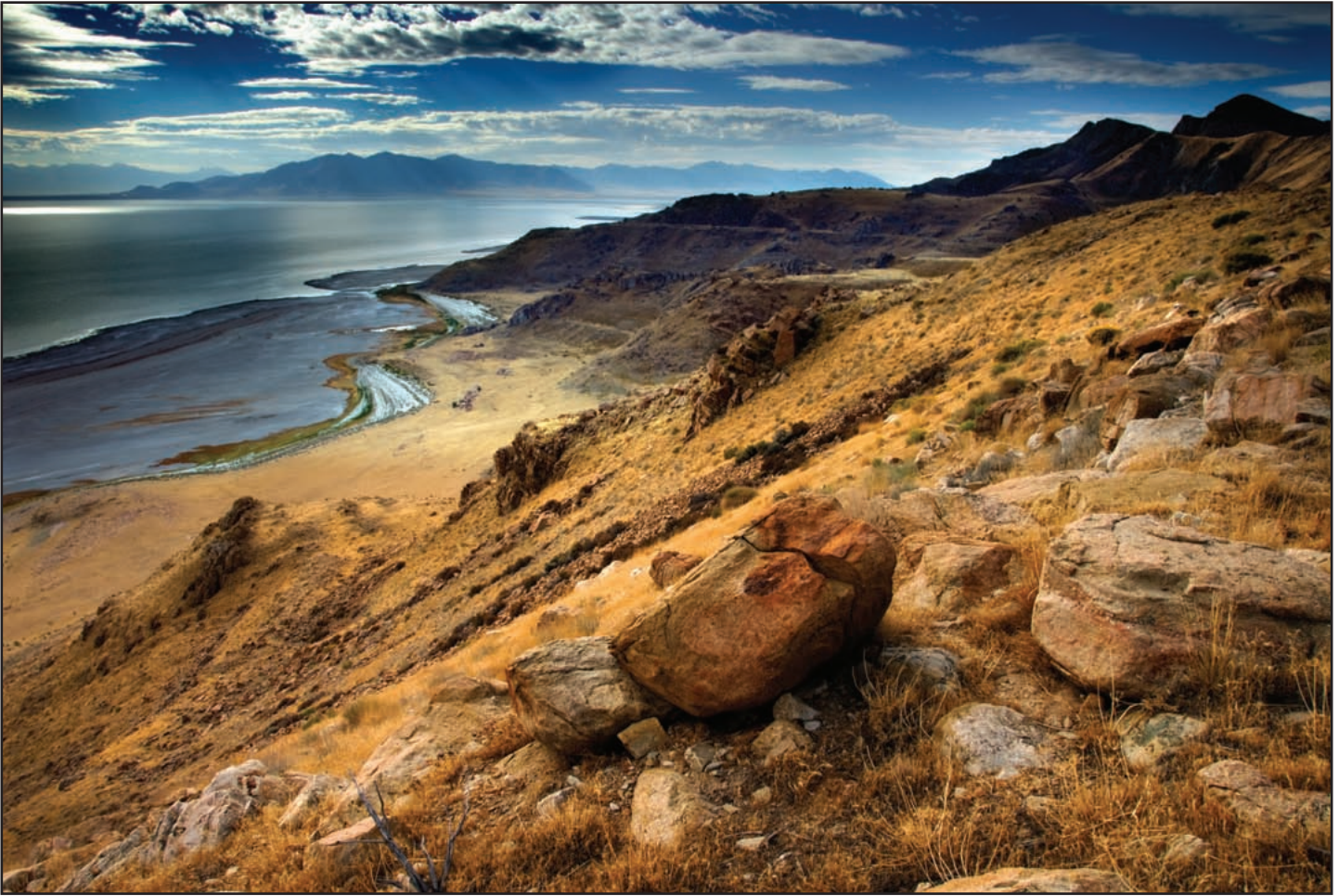
A Look Down Stansbury Island by Charles Uibel

Stansbury Island is the second largest island (22,314 acres) in Great Salt Lake, second to Antelope Island (23,175 acres). If you know and love Antelope Island, discovering Stansbury Island is like recognizing the odd beauty and quiet intelligence of a stand-offish younger sibling of a handsome, accomplished, friend you've known forever. Antelope Island is the old friend. Stansbury Island is the inconspicuous sibling.