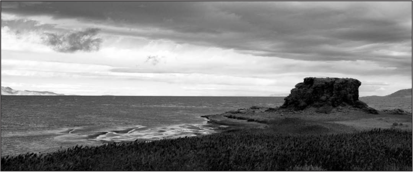
Black Rock by Michael Slade

I am sure that most who receive the FRIENDS newsletter know what experts are saying about Great Salt Lake (GSL): that it is the most important inland shorebird site in North America; that it supports 75% of the state's wetlands; that it is one of the most significant wildlife habitats in our hemisphere; and that it is the re-fueling stop for millions of migratory birds. Certainly, GSL is one of Utah's crown jewels – though perhaps the least understood and most neglected one.