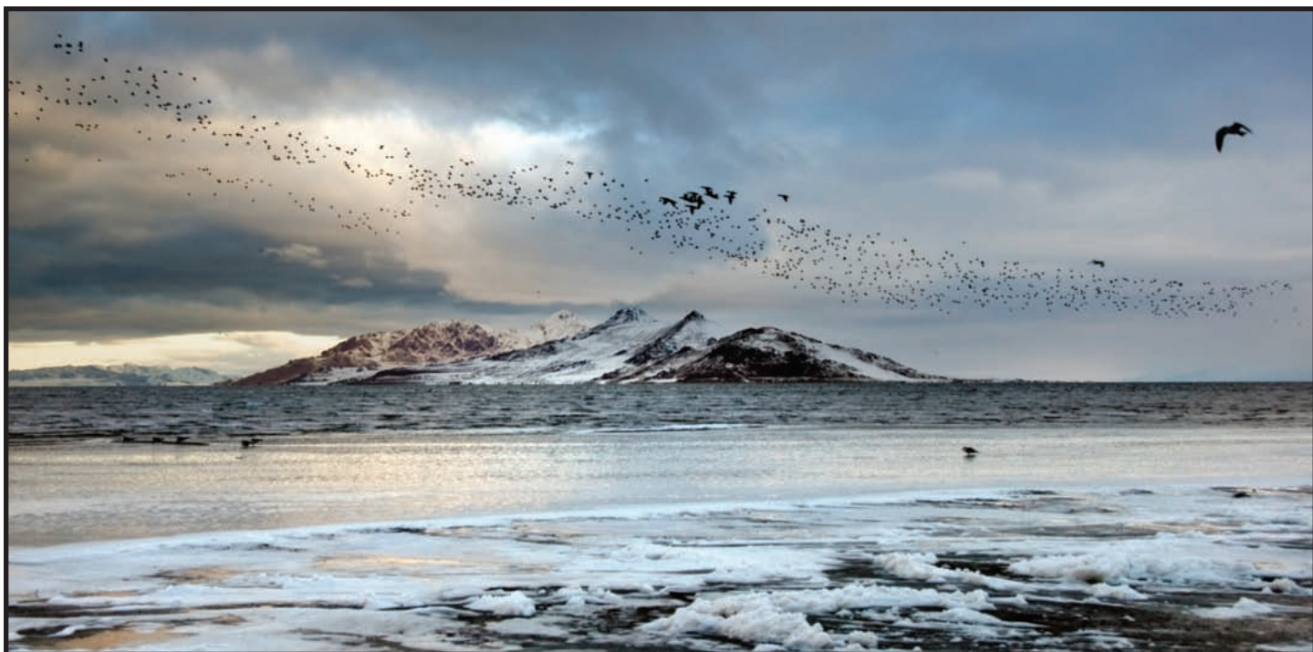
Ducks Over Antelope Island by Charles Uibel

Remember, all membership fees and donations are tax deductible to the extent allowed by law.