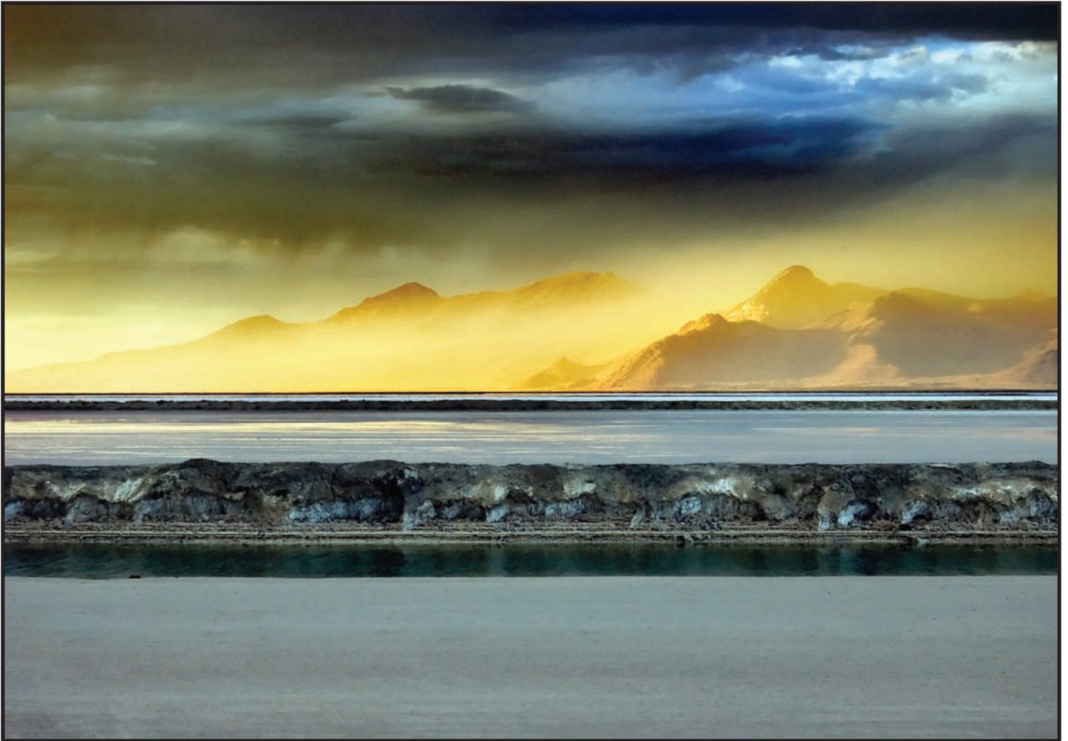
Stansbury Island Dust Storm by Charles Uibel ©2007

The mission of FRIENDS of Great Salt Lake is to preserve and protect the Great Salt Lake ecosystem and to increase public awareness and appreciation of the lake through education, research, and advocacy.