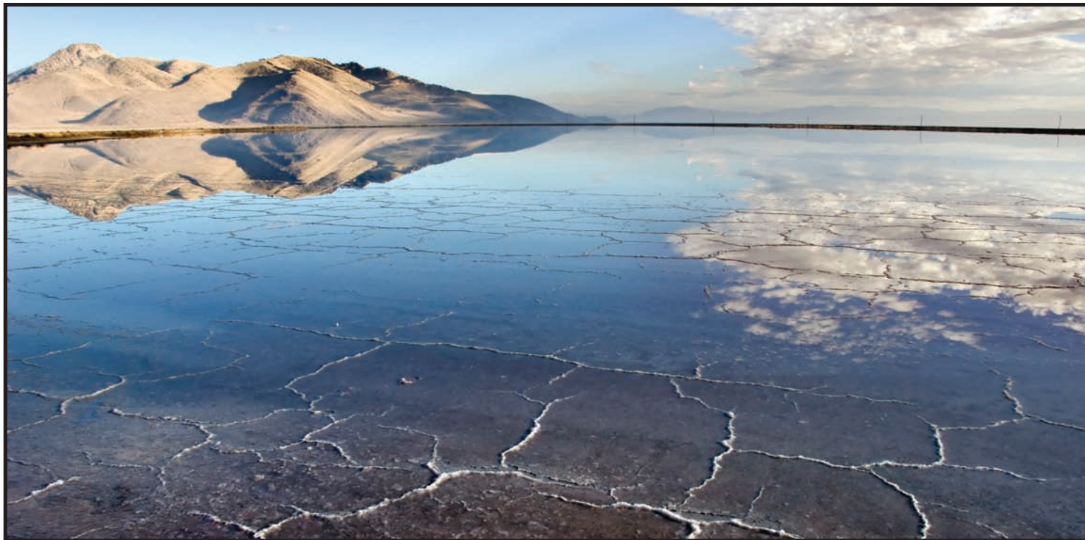
Broken Mirror by Charles Uibel