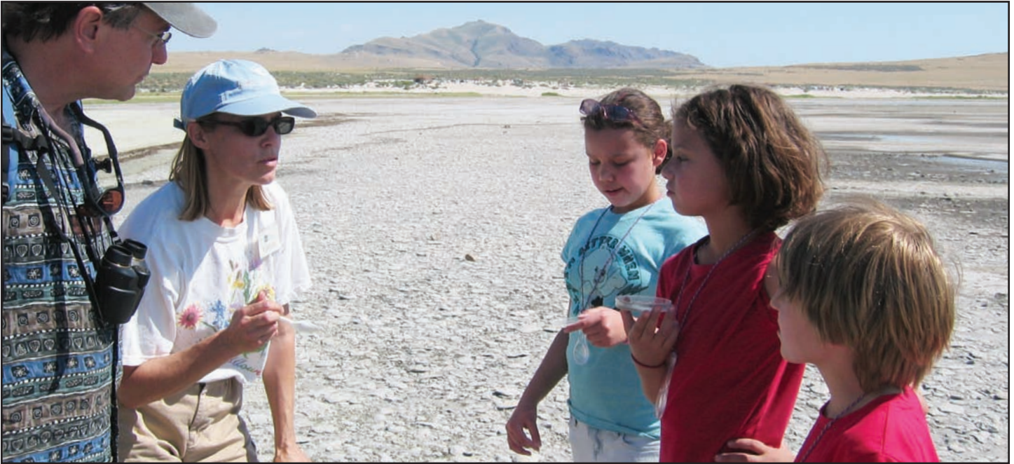
GSL Tête-a-Tête by L. de Freitas

Last spring, the Ogden City School Board voted to create its first Environmental Magnet School at Grandview Elementary. A magnet school is one which utilizes a thematic approach to educating students by offering specialized courses or curricula to enhance student learning and interest.