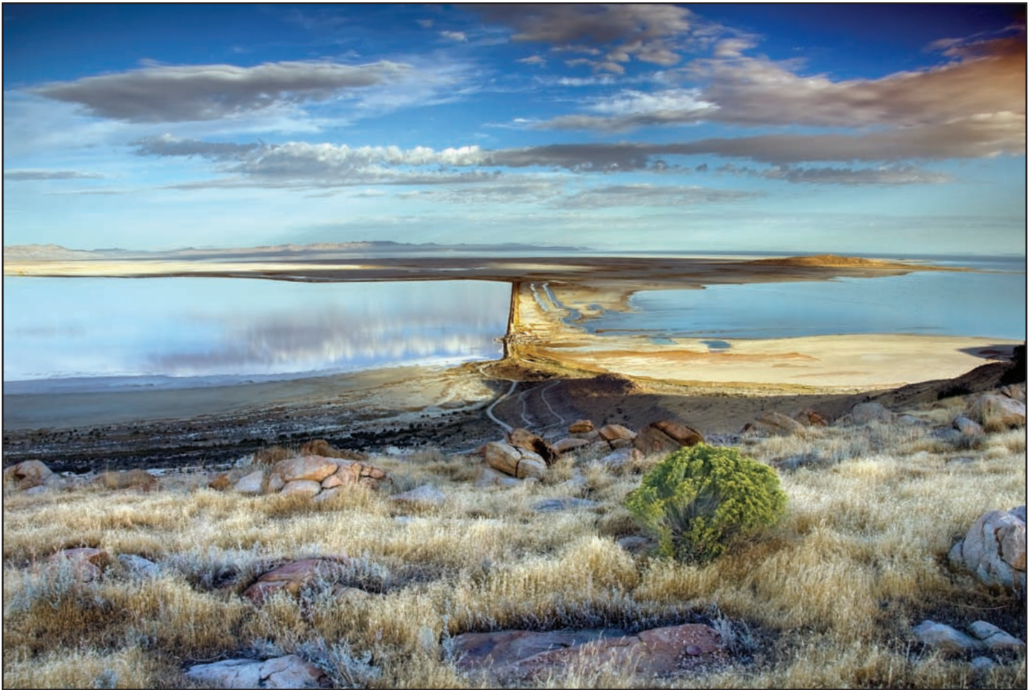
A Fabulous Set of Moments by Charles Uibel

Located between Tooele and Grantsville, north of I-80 West, Stansbury is called a sometimes-island. This is because of historic high stands of Great Salt Lake that have isolated the island from the mainland where it is connected by the Stansbury bar. The island's northern and eastern shores border Gilbert Bay, the southern part of the western part of Great Salt Lake. The island's western and southern shores are complexes of evaporation ponds.