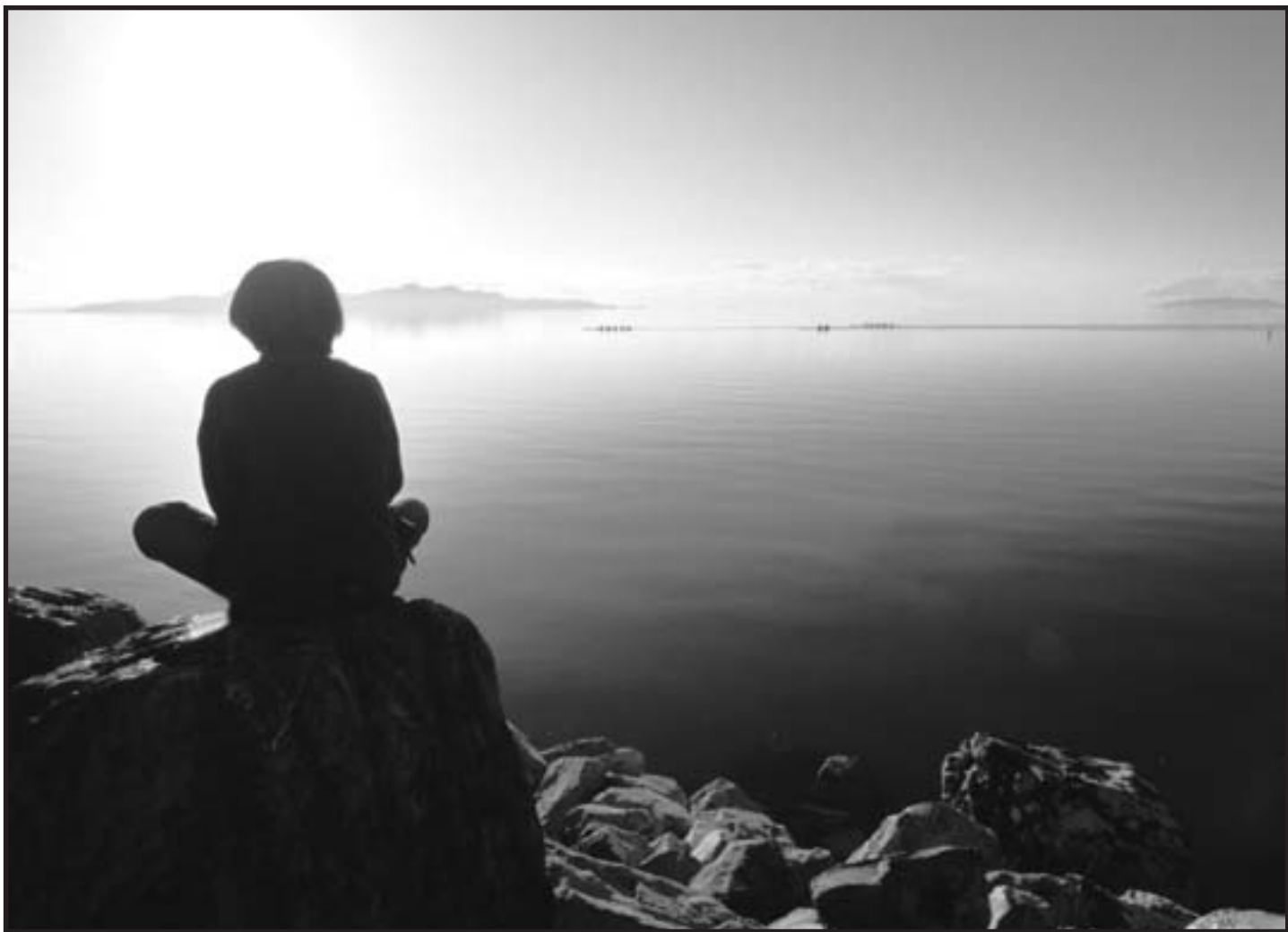
Crew Watching by Stephen Trimble ©2004

a hint of light over the mountains, and we are escaping it. It feels as though if we keep going, we can outrun the dawn and disappear, back into that globe of darkness that we have learned to love more than anything else in the world.