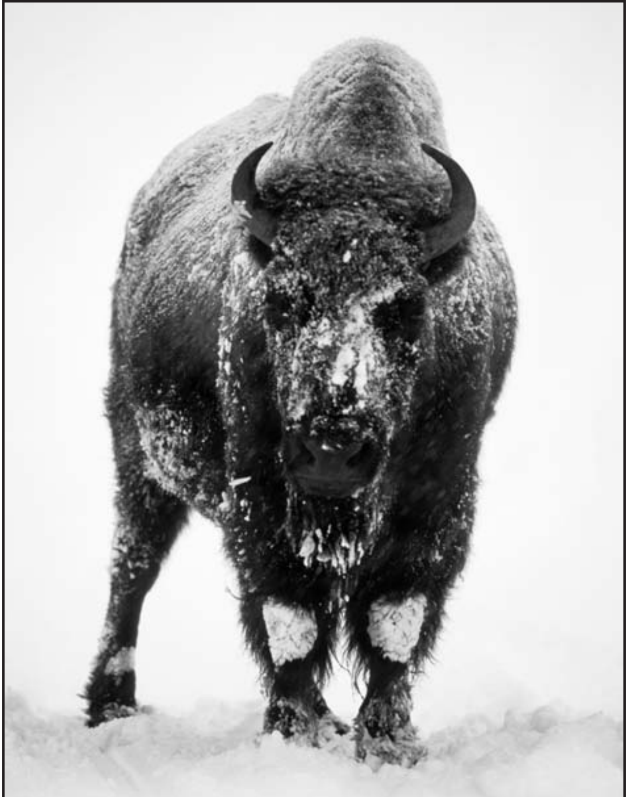
Bison by Gary Crandall ©2002