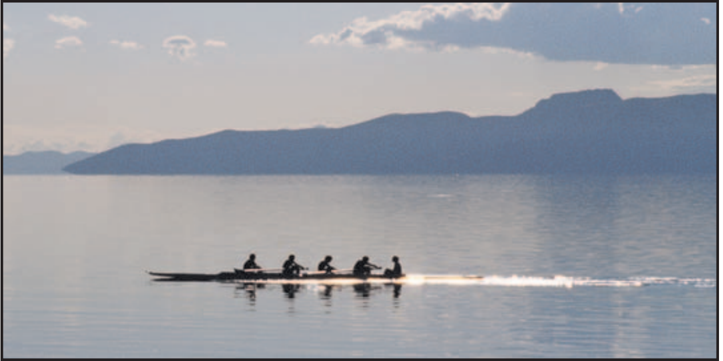
Hot Wake Stephen Trimble ©2004

“Push off from dock in two. One...two.” Our coxswain makes the call and we all shove off, the boat sliding out into the water as we begin to row. We follow his calls and shiver a little as we maneuver out of the marina, past rows of sailboats dark and still in the windless night air. The boat makes rhythmic noises as we row out, the thud of oars in oarlocks, creaks of pressure on fiberglass foot stretchers, and the squeak of sliding seats. The boat passes into the strait at the mouth of the harbor, and our coxswain turns us out towards open water. We enter the lake.